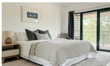
Yanawal Units | $270 p/n