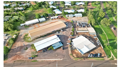
6 Arnhem Road | $950k