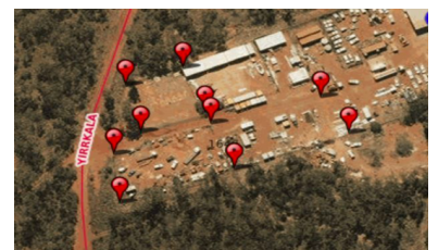
85 Galpu Road | $600-850 p/w