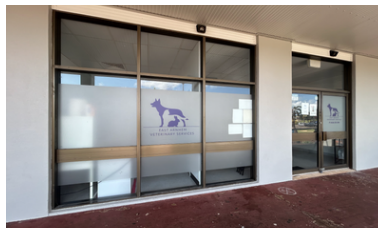
Shop 2 Arnhem House