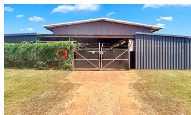
22 Pera Circuit | $570K