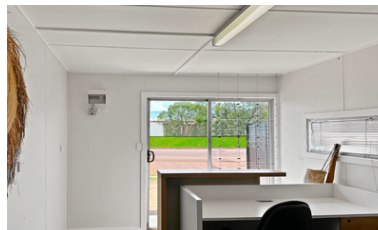
6B Traeger Close | $700 p/w