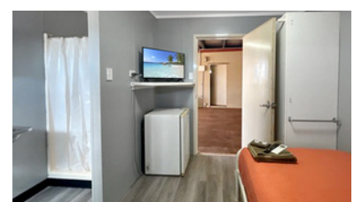
Wallaby Beach $175 p/n